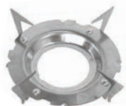
Pot Support Included