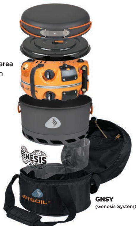
GNSY (Genesis System)

Maximum cooking area and versatility when you're off the grid.