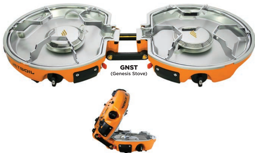
GNST (Genesis Stove)

Adding a compact cook top to your camp kitchen.