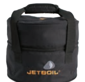
Genesis System Bag