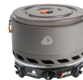
HALFGEN + 5L FLUXRING COOK POT