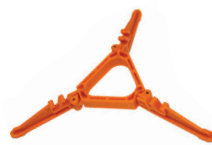
Fuel Can Stabilizer