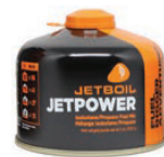
JetPower Fuel Canisters