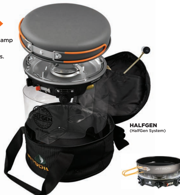
HALFGEN (HalfGen System)

Expanding your basecamp cooking possibilities.