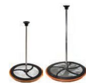
Silicone Coffee Presses