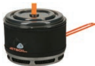
1.5L Ceramic FluxRing Cook Pot