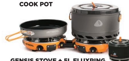
GENESIS STOVE + 5L FLUXRING COOK POT + LUNA + 1.5L CERAMIC FLUXRING COOK POT